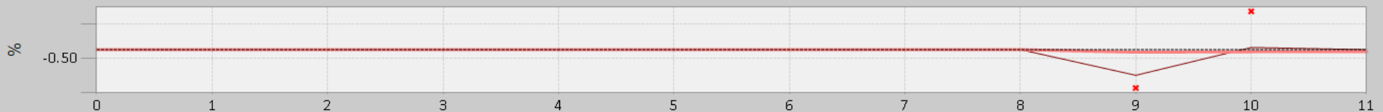
(N2) - N2, Core Speed, % -- N762CK-1 -- 695145 CRUISE GAS PATH